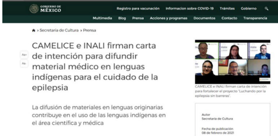
Document signed with the government for the diffusion of epilepsy education in native dialects