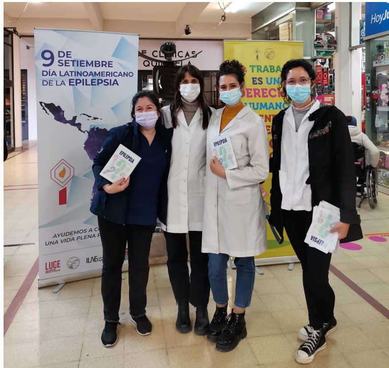
Latin American Epilepsy Day