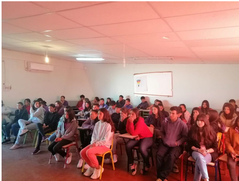
Students at Valente High School