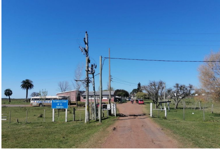
Rural High School in Valente1