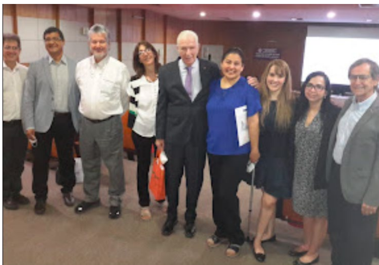
Epilepsy Week in Asuncion