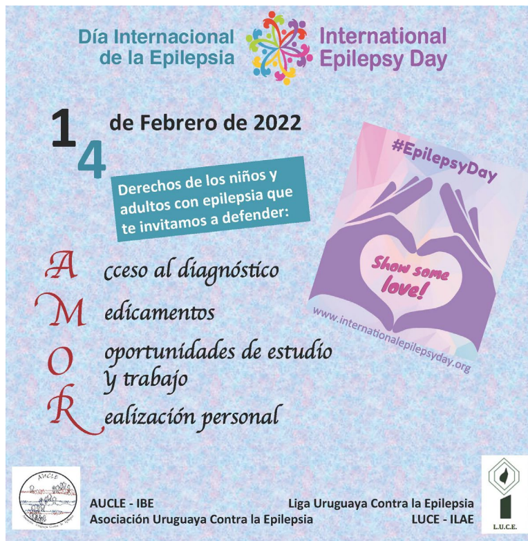
International Epilepsy Day 2022