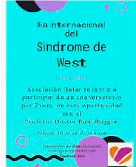
West Syndrome Day 2021