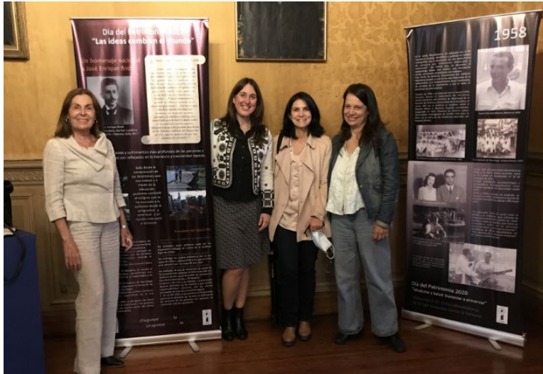
At the Anthropological Museum