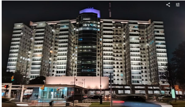
University Clinical Hospital in purple