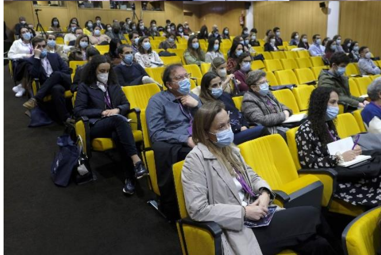
34th National Meeting of Epileptology (34 ENE) – Oporto 2022