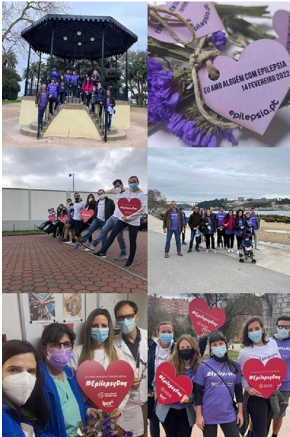
2022 International Epilepsy Day in Portugal