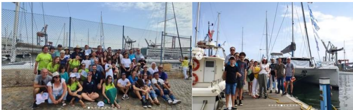
Sail for Epilepsy in Lisbon