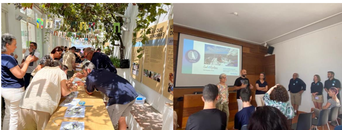
Sail for Epilepsy in Almada