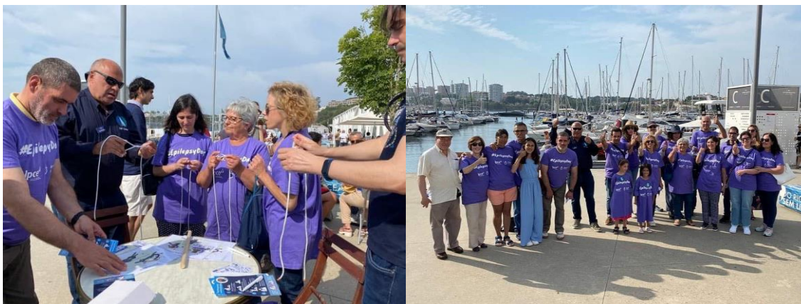
Sail for Epilepsy in Oporto