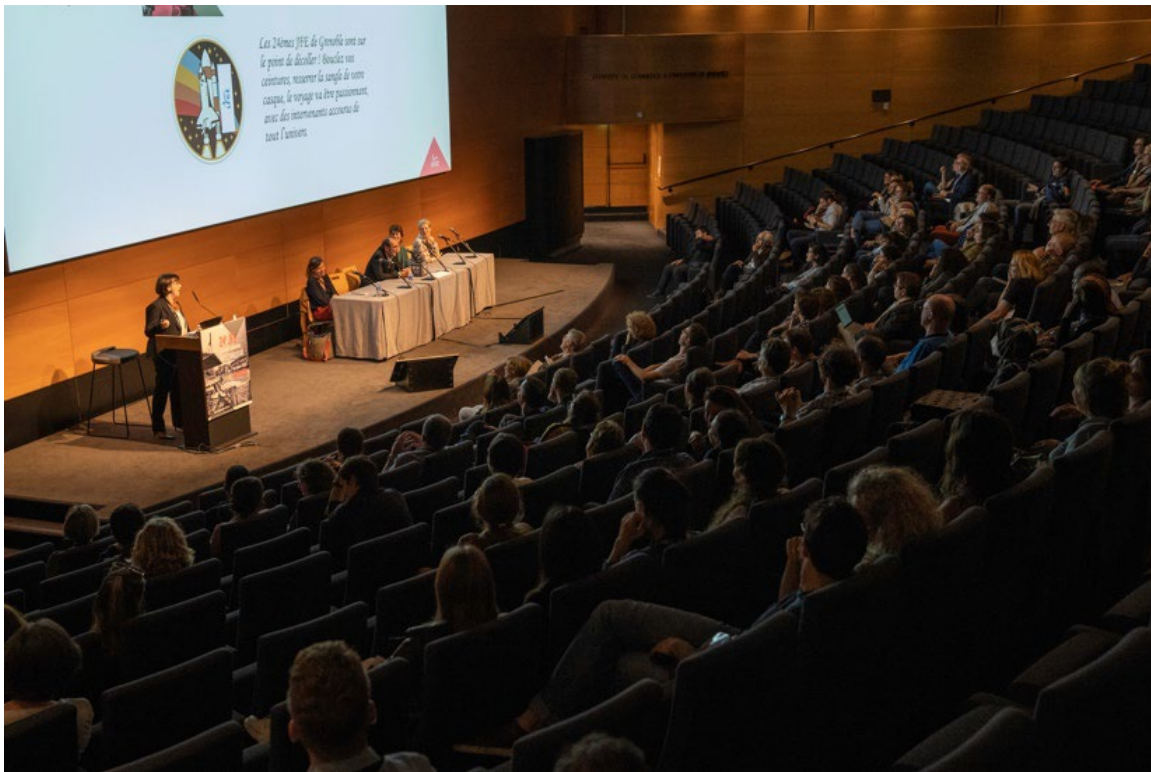
JFE 2022 Congress Plenary Session