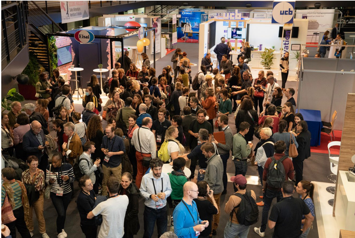
JFE 2022 Congress