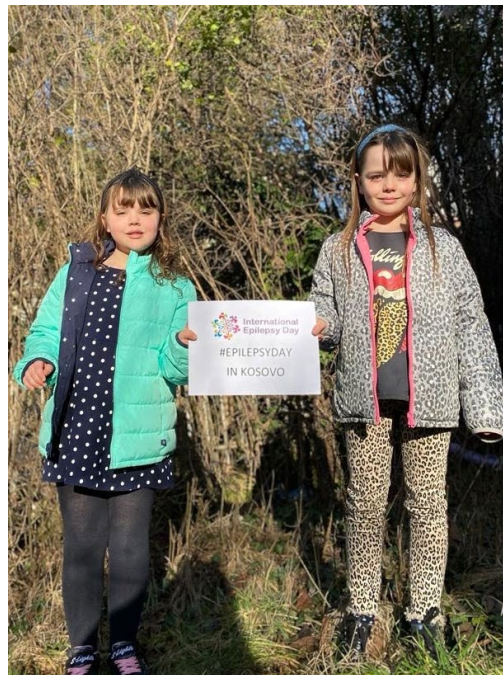
International Epilepsy Day Informative Campaign, 2021, in Prishtina, Kosovo