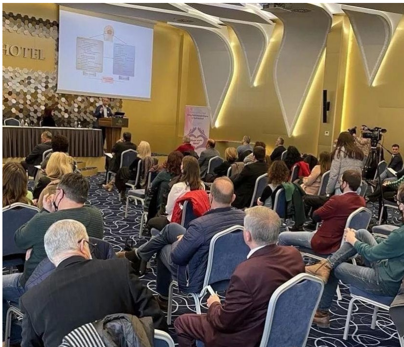
Participants in the Epilepsy and COVID-19 Symposium, 2022, in Prishtina, Kosovo