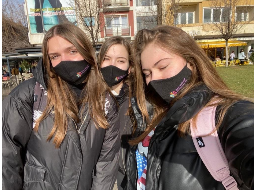
Students from working group for the International Epilepsy Day Informative Campaign, 2021, in Prishtina, Kosovo