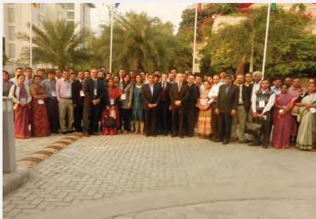
Figure 3. Group photograph of participants of Epilepsy School.

A total of fourteen sessions were held, which were spread over four days. Session titles included: Differential Diagnosis of Epilepsy, Faints & Funny Spells; Approach to a Person with New Onset Epilepsy; Epilepsy Video Presentation Quiz by Faculty; Benign Epilepsy Syndromes; Treatment Decisions; When to Stop AEDs?; Non-epileptic Paroxysmal; Morbidity & Mortality in Epilepsy; Epilepsy Surgery; and Video and Case Presentations by the faculty and delegates.