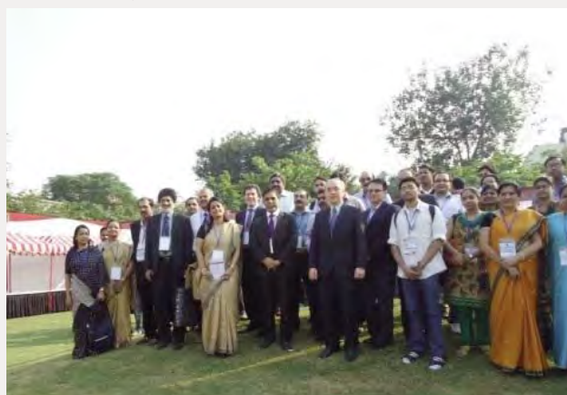
Figure 2. Group photograph of EEG workshop participants.