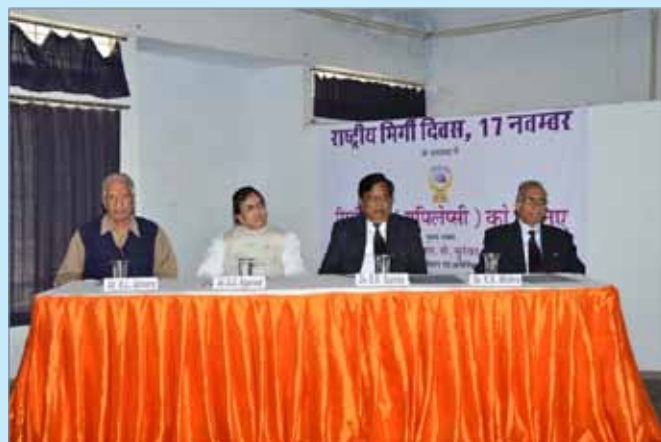
"National Epilepsy Day Celebrations at Swasthya Kalyan Bhawan, Sitapura, Jaipur