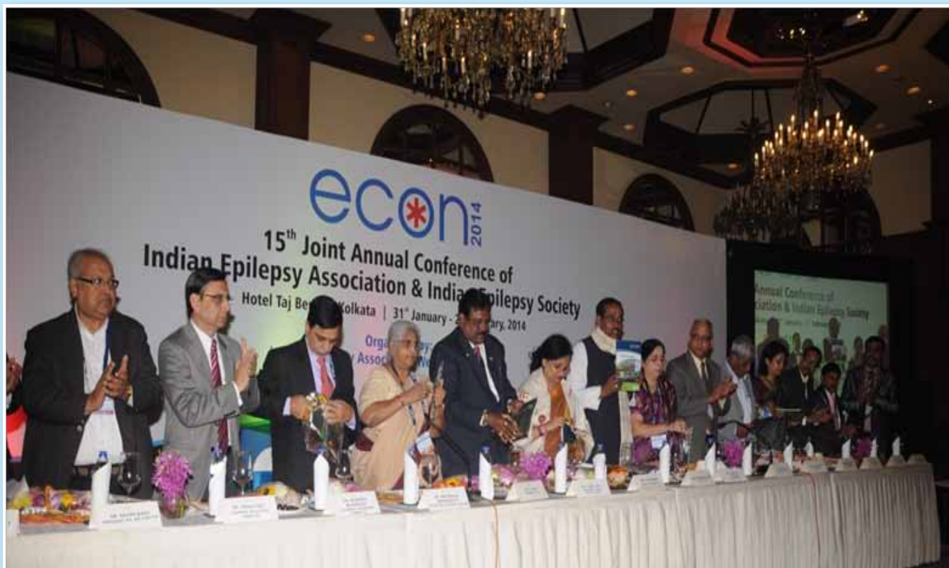
Inaugural Program ECON 2014