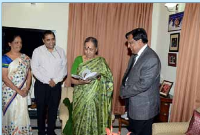
"Presentation of First copy of " HANDBOOK OF EPILEPSY – A PRACTICAL GUIDE " to Her Excellency ,Governor of Rajasthan Smt. Margaret Alva"