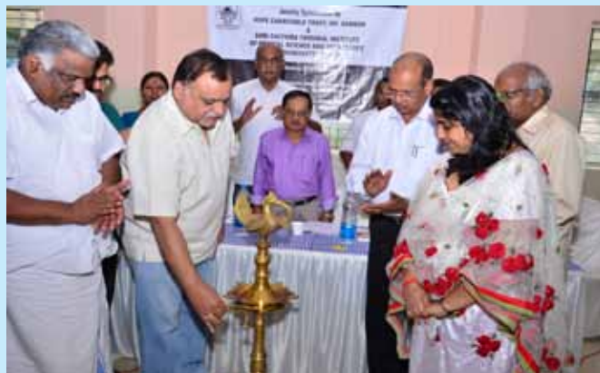
Epilepsy camp in Kalpetta, Wayanad