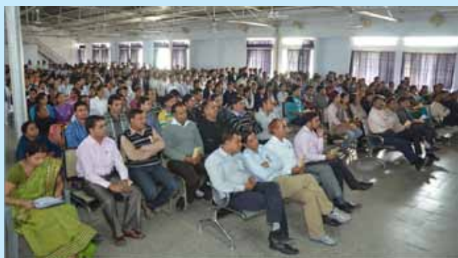
"Large Audience at Epilepsy Awareness Programme