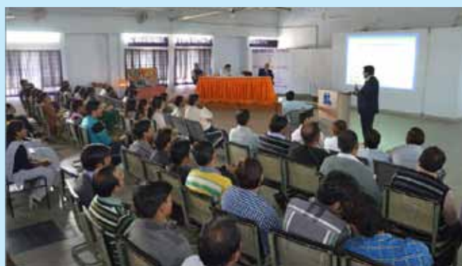
" Addressing the gathering on National Epilepsy Day"