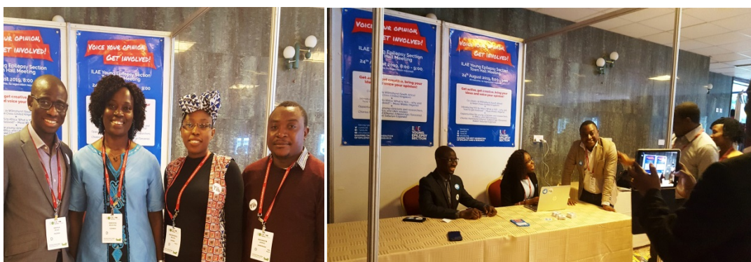
Figure 4: At the YES booth