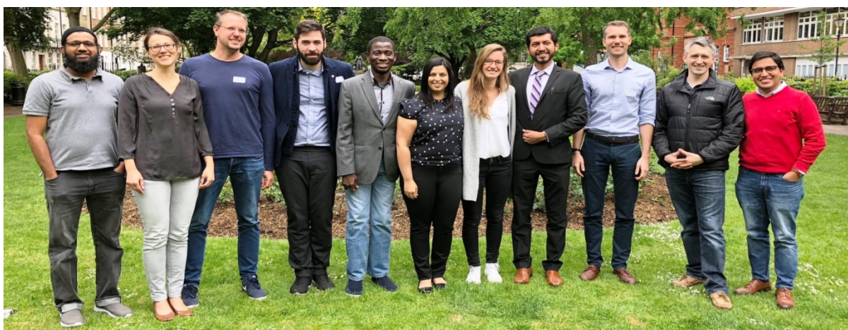
Figure 5: Leadership elected at the kick-off workshop in London

Since the kick-off workshop in London, May 2018 where only one person from sub-Saharan Africa was in attendance, YES-Africa has grown (although much slower than other regions). The AEC provided an opportunity to connect with one another and our membership has more than doubled.