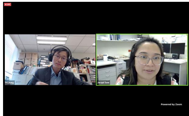
Participation of HKES in AOEC 2022