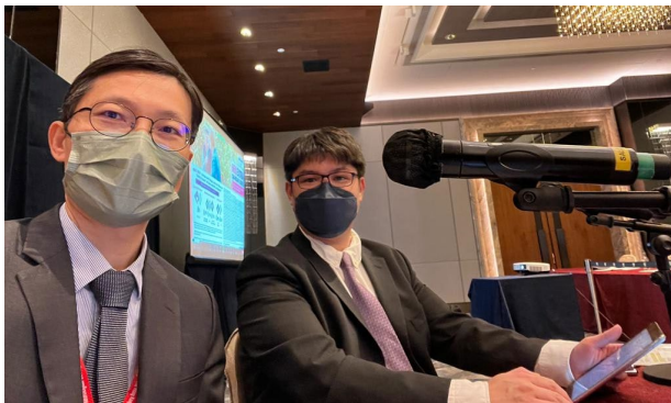
Hong Kong Epilepsy Society and Hong Kong Neurological Society - Joint ASM