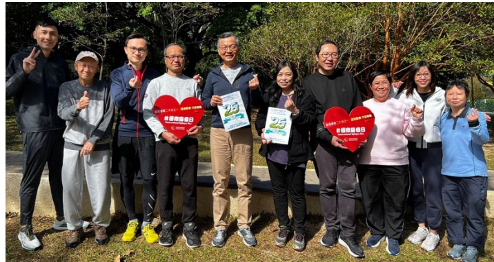
International Epilepsy Day, Hong Kong, SAR, China

2021 and 2022 were two remarkable years in which many of our day-to-day activities on epilepsy initiatives, advocacy, clinical work, or research had been disrupted. Notwithstanding this, Hong Kong Epilepsy Society (HKES) celebrated its 20th anniversary in 2022. We made special COVID-19 souvenir masks for our patients and guests. We had received many celebratory remarks from our colleagues and friends through videos and zooms. We had many educational and interesting webinars throughout the two years of lock-down. Moreover, we were able to help promote epilepsy awareness through the initiative of International Epilepsy Day. We also joined hands with our Asian counterparts in meetings (including AOEC and our own annual scientific meetings). We have, and will continue to, sponsor our members in various educational activities, whether physical or on-line. We shall continue to strengthen our ties with our collaborators e.g., ILAE, ASEPA and CAEE.